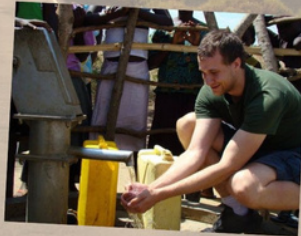
Ryan's Well celebrates 1000th well! 2015