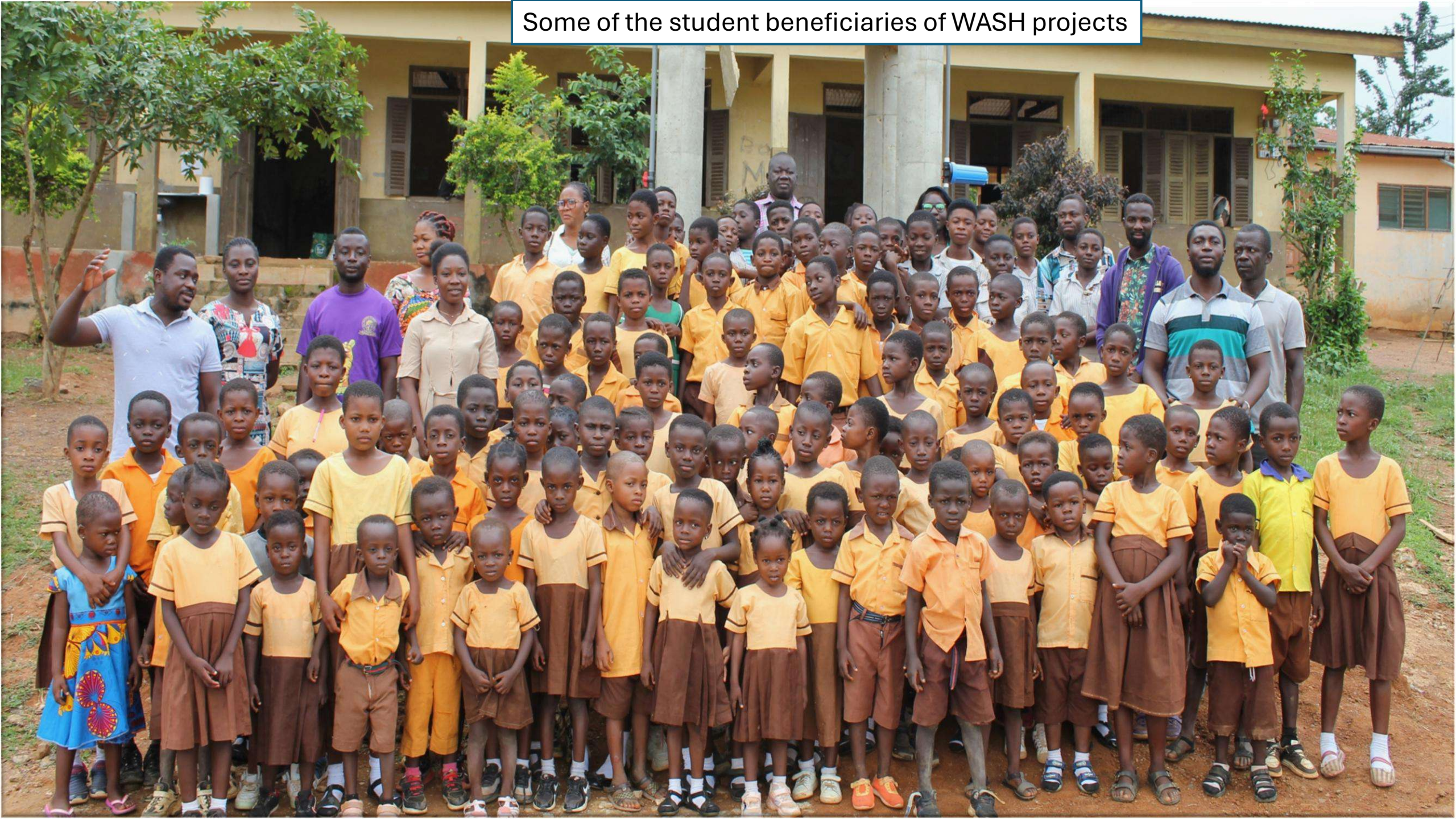
Some of the student beneficiaries of WASH projects