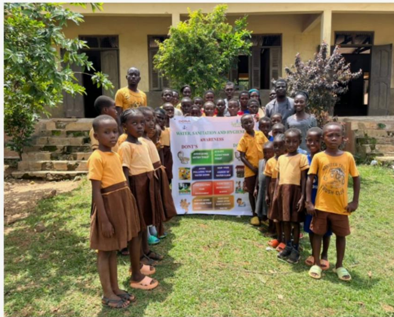
DELIVERY OF WASH AWARENESS BANNER TO ADDAIKROM KWAOSO D/A BASIC