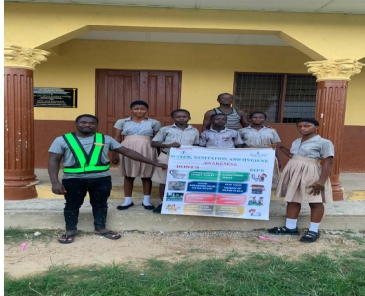
DELIVERY OF WASH AWARENESS BANNER TO FENASO KWAADOKROM D/A BASIC SCHOOL