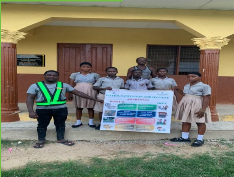
DELIVERY OF WASH AWARENESS BANNER TO FENASO KWAADOKROM D/A BASIC SCHOOL