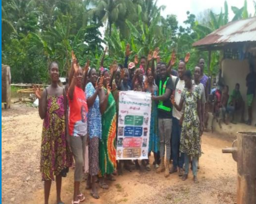
DELIVERY OF WASH AWARENESS BANNER TO TSOTSOBUOSO II COMMUNITY MEMBERS