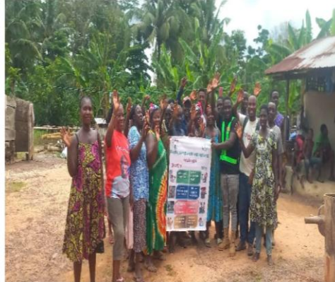
DELIVERY OF WASH AWARENESS BANNER TO TSOTSOBUOSO II COMMUNITY MEMBERS