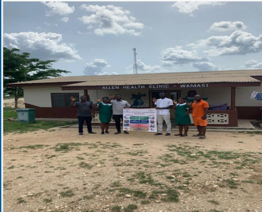
DELIVERY OF WASH AWARENESS BANNER TO FAWOOMAN WAMASI CHIPS STAFFS