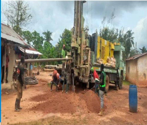
DRILLING OF DEEP BOREHOLE AT TSOTSOBUOSO II COMMUNITY