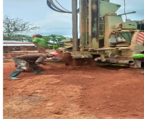
DRILLING OF DEEP BOREHOLE AT TSOTSOBUOSO II COMMUNITY