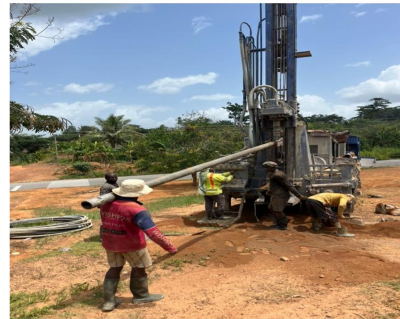
DRILLING OF DEEP BOREHOLE AT ADDAIKROM KWAOSO D/A BASIC