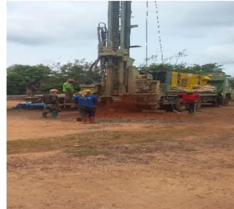
DRILLING OF DEEP BOREHOLE AT TSOTSOBUOSO II COMMUNITY