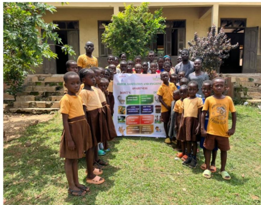
DELIVERY OF WASH AWARENESS BANNER TO ADDAIKROM KWAOSO D/A BASIC