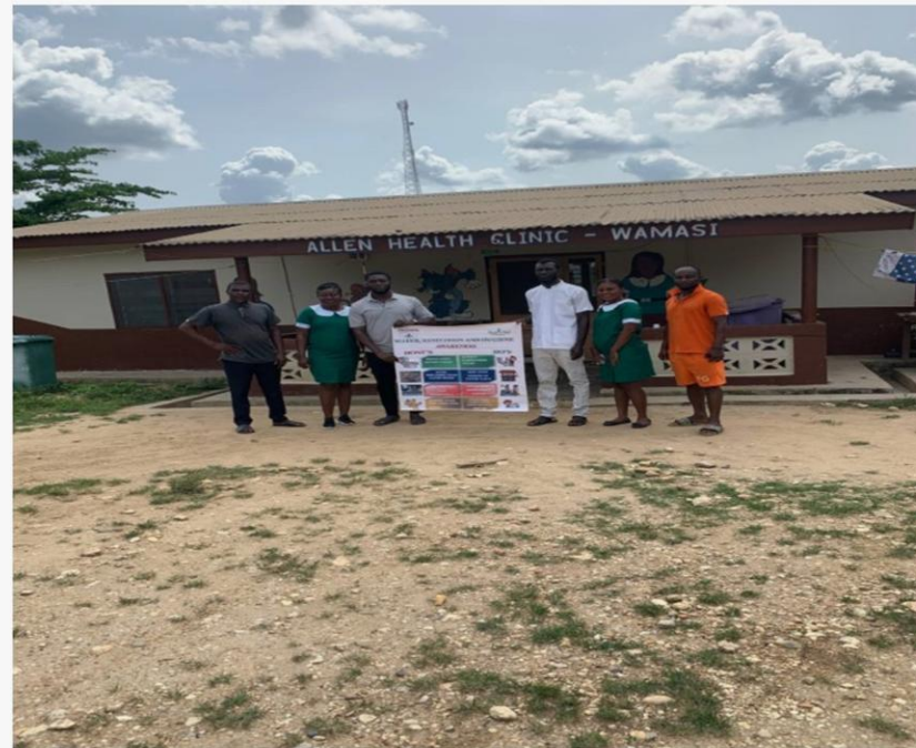
DELIVERY OF WASH AWARENESS BANNER TO FAWOOMAN WAMASI CHIPS STAFFS