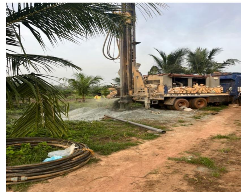
DRILLING OF DEEP BOREHOLE AT DEBRA TAABOSERE CHIP COMPOUND