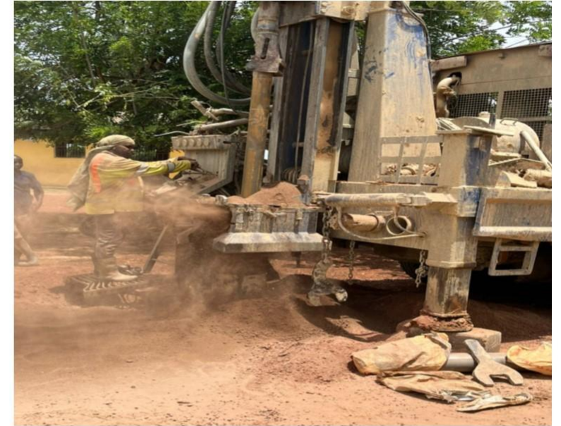
DRILLING OF DEEP BOREHOLE AT FENASO KWAADOKROM D/A BASIC