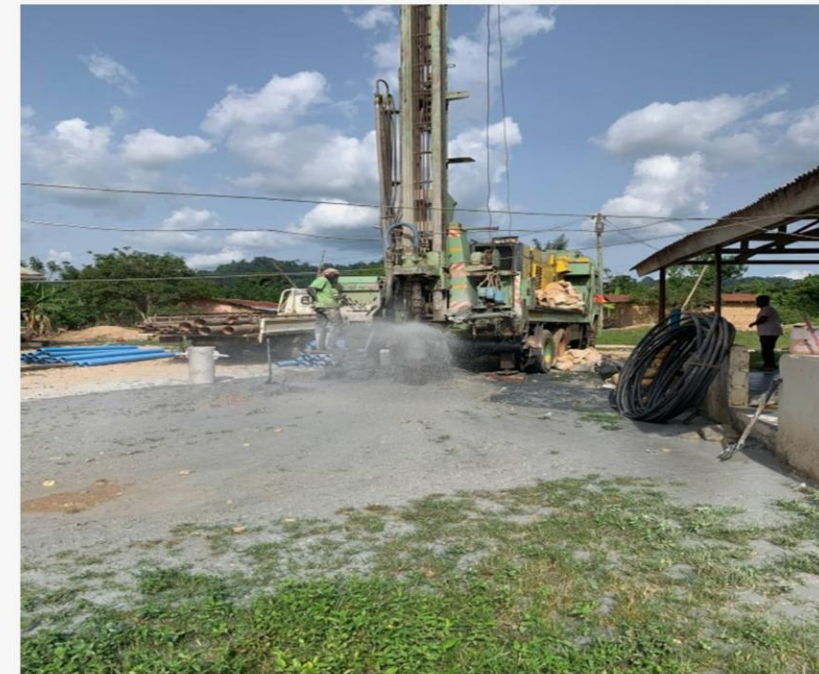
DRILLING OF DEEP BOREHOLE AT FAWOOMAN WAMASI CHIP COMPOUND