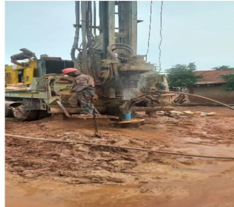
DRILLING OF DEEP BOREHOLE AT TSOTSOBUOSO II COMMUNITY