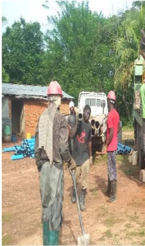
DRILLING OF DE TSOTSOBUOSO