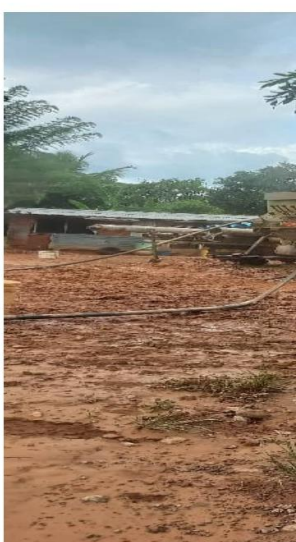
DRILLING OF DE TSOTSOBUOSO