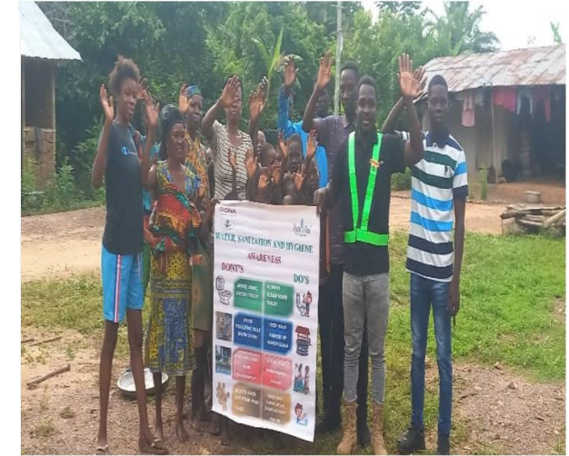
DELIVERY OF WASH AWARENESS BANNER TO TSOTSOBUOSO III COMMUNITY MEMBERS