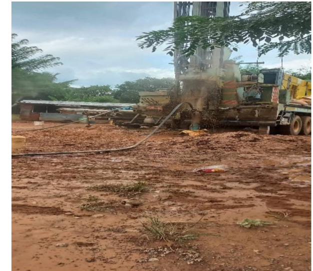
DRILLING OF DEEP BOREHOLE AT TSOTSOBUOSO III COMMUNITY