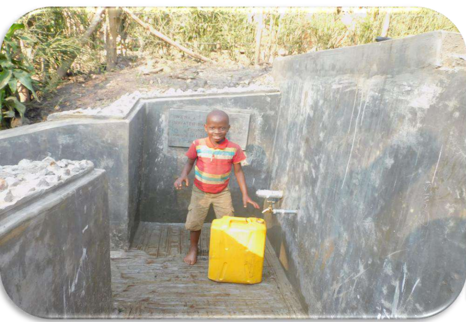
Pictures of Happy users protected springs constructed in 2024 August-December.