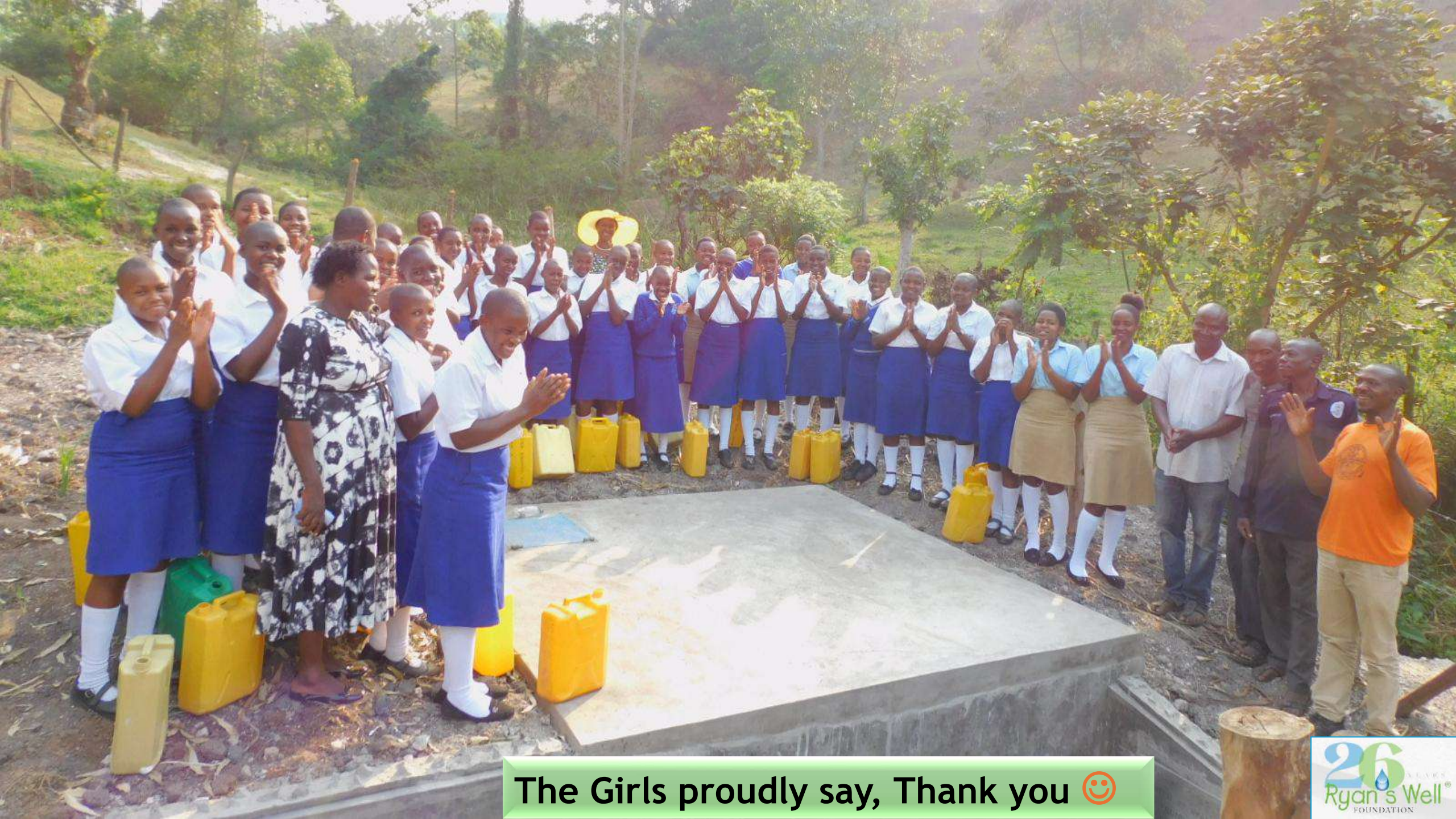
The Girls proudly say, Thank you 😊