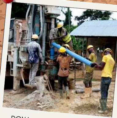
DONA encasing a deep well in Ghana after accessing water.

<u>STEP 1</u>: After the Ryan's Well Foundation receives your donations, the funds are transferred to our local partners using the leading international payment platform, Western Union. Once securely deposited into our established partner's account, the work can begin!